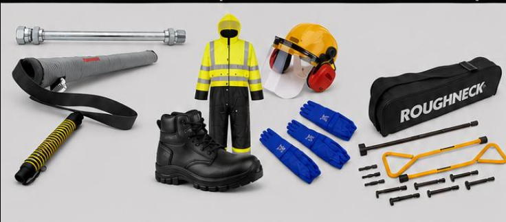
TOOLS, SAFETY KITS & MANHOLE LIFTING KEYS