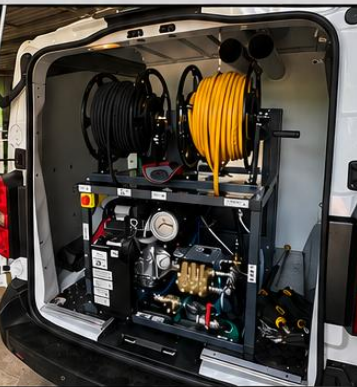
HIGH PERFORMANCE JETTING MACHINES