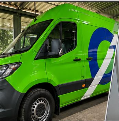
PROFESSIONALLY KIT OUT VANS