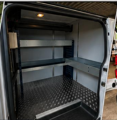
BESPOKE INTERIOR RACKING