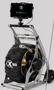
CCTV SURVEY CAMERAS